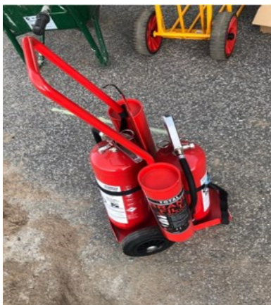
A trolley to carry the extinguishing equipment facilitates work.