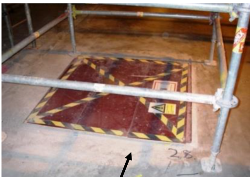
The warning sign here is a good example of additional marking on a protective cover.