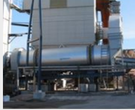
Drum dryer at asphalt plant.

Examples of spaces that can be classified as confined spaces are tanks, wells, process vessels, sewage, gas or fluid pipes, air shaft, elevator pits, culverts, basement premises, drum dryers, concrete mixers, aggregate bins, installation spaces in/