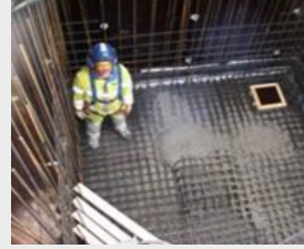
Elevator pit on construction site.