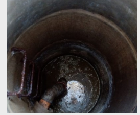
Manhole for water and sewer works.